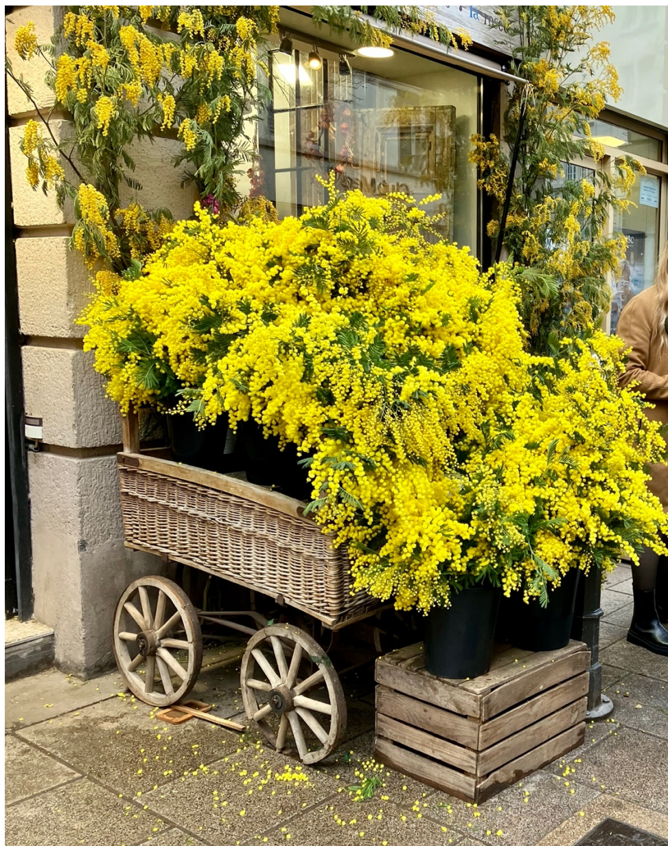
Mimosa ; Strasbourg. Spring is on its way