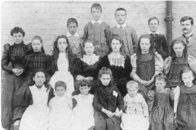
Ashbury children 1898